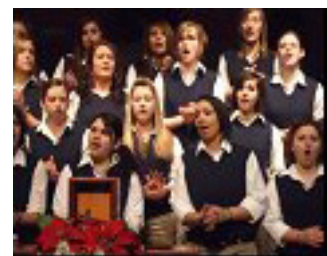
New Creations Choir