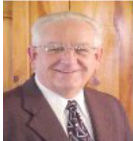
Bishop Tim Cummings